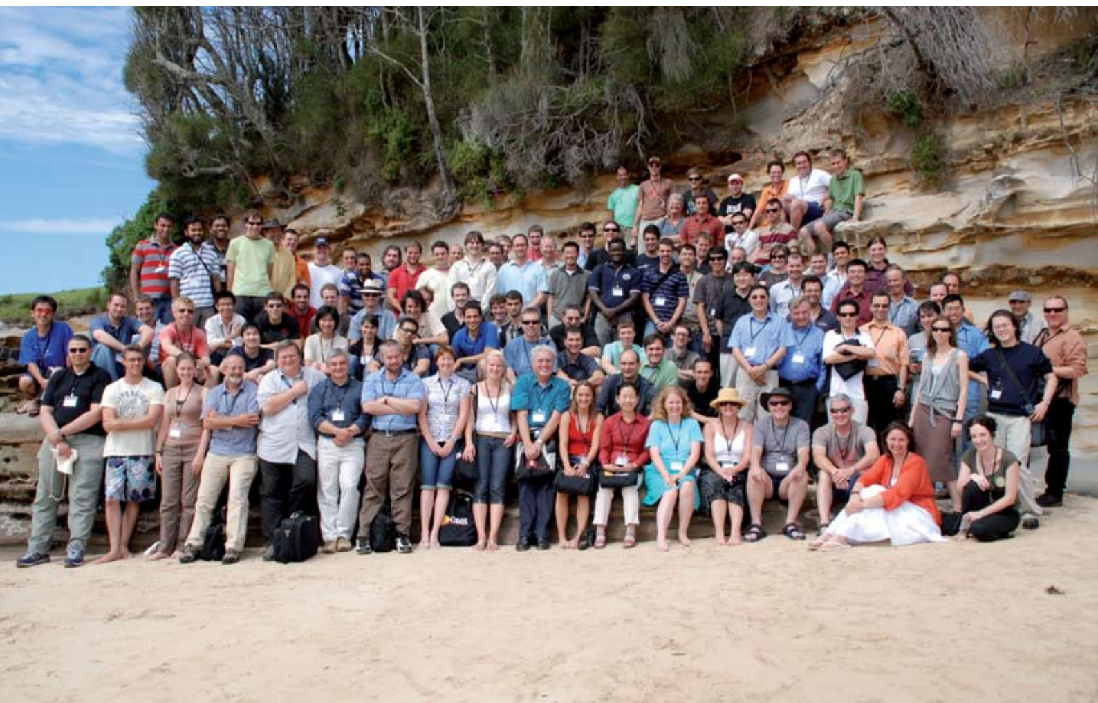
The CUDOS team at the Annual Workshop