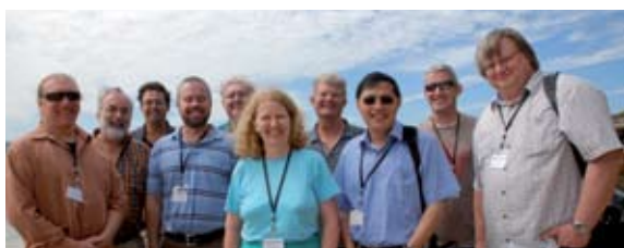
CUDOS Chief Investigators.